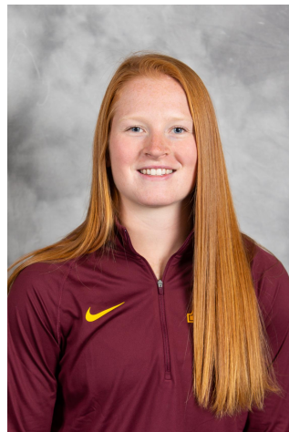
Minnesota Gopher photo